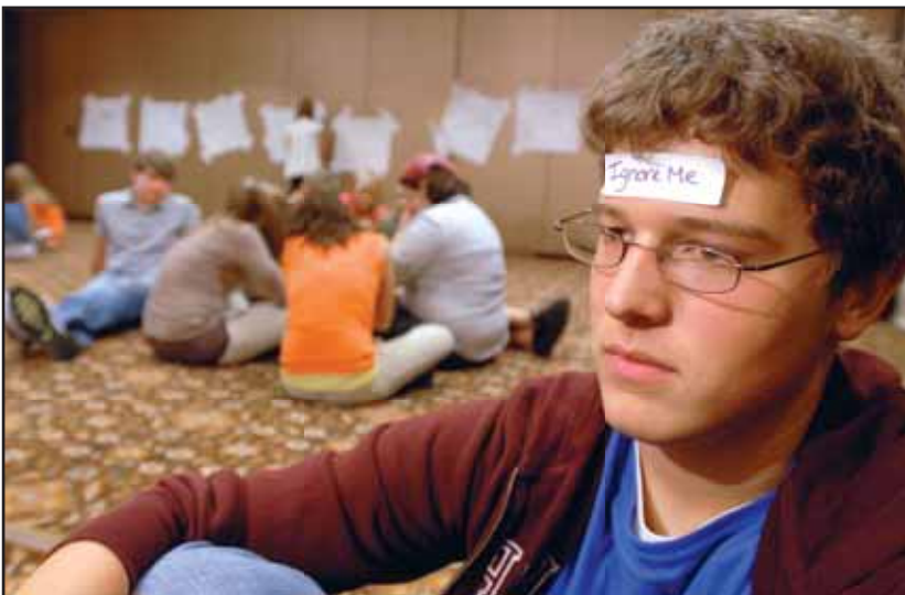
In middle schools, students learn about bullying behaviors and preventions through teacher-led role-playing sessions that result in healthier school environments.