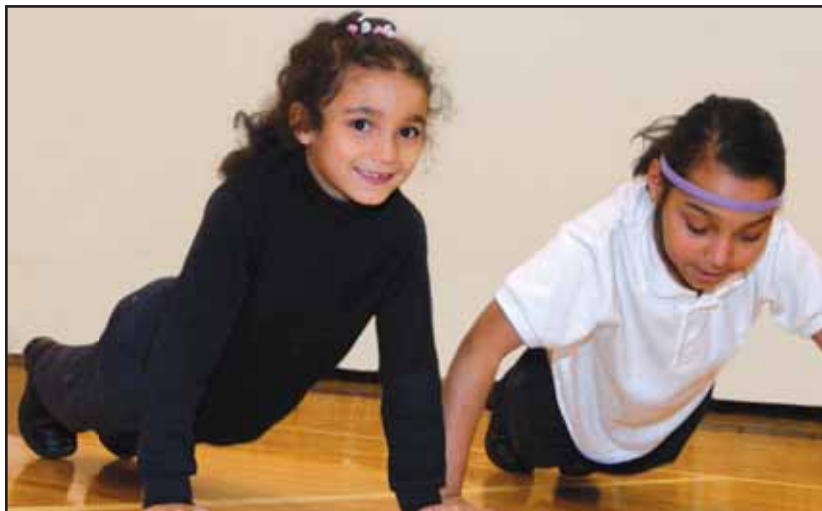
At the Boys & Girls Club of Erie, everyone succeeds in the SPARK Active Recreation program. SPARK is being utilized at more than 140 sites across Pennsylvania.