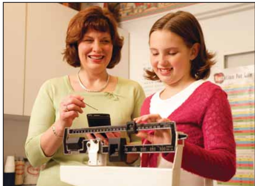
Through Highmark Healthy High 5's Health eTools for Schools, children's collective health data, including Body Mass Index (BMI), is a catalyst for health-related changes at school.

For the kids, it's plenty of fun. "And, they like being part of a group that's working toward better health," she says. ■