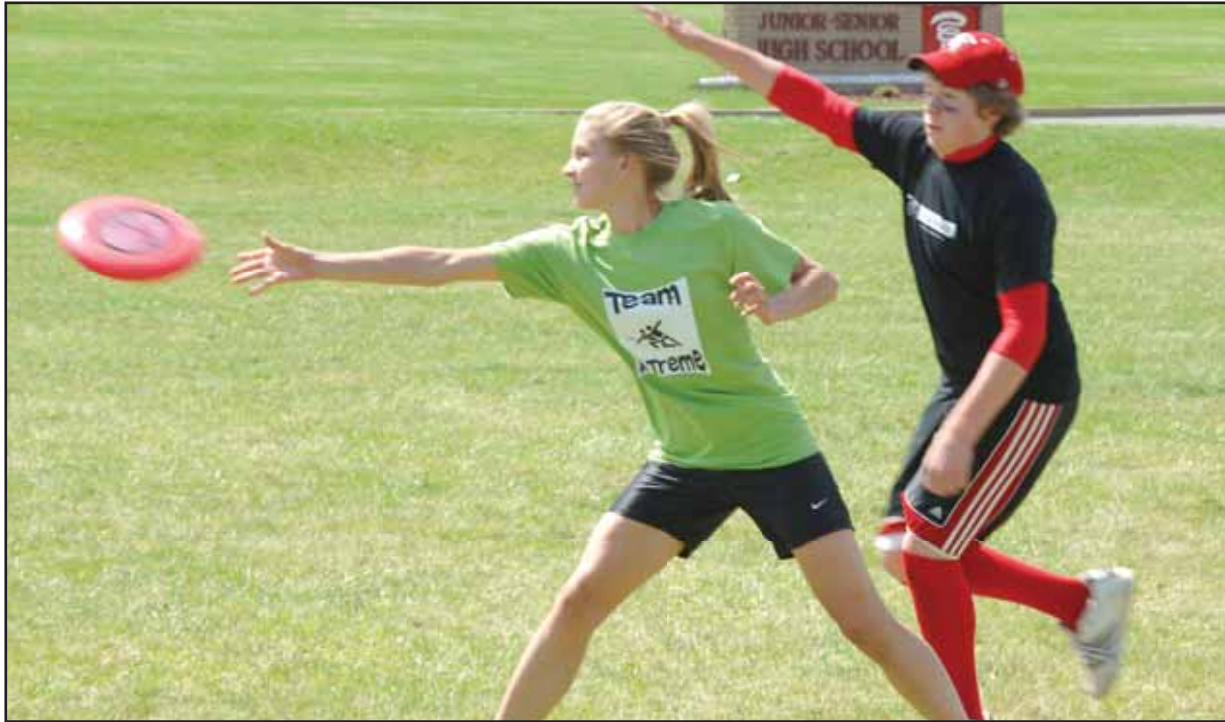
Ultimate Frisbee fundraisers are one way teens work through nrg to fund their own healthy programs in their schools and communities.

The nrg Powered by Choice campaign, funded by Highmark Healthy High 5, empowers teens, ages 13–18, to promote nutrition and physical activity to their peers and younger children. Teens can also hold a fundraising event to purchase equipment that will make a healthy change in their school or community recreation center. The program was developed by Highmark Healthy High 5 partner, the Penn State Hershey Center for Nutrition and Activity Promotion.