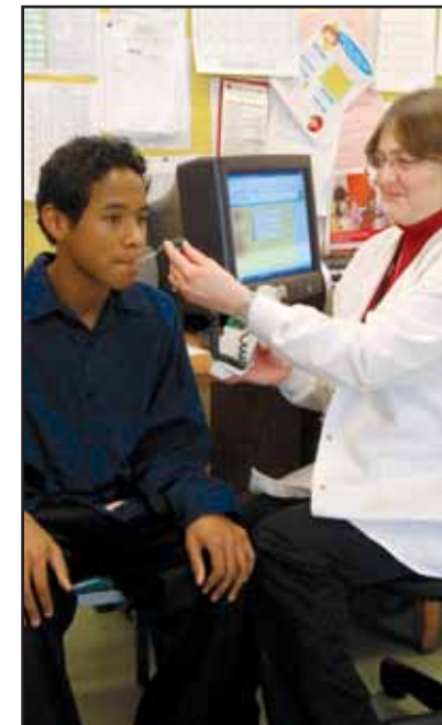
In the Erie area, nurses at over 40 schools are using Health eTools to record student health data more efficiently, freeing up time to address student health concerns.

Other schools in the district have added Dance Dance Revolution and Boot