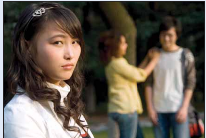
According to the U.S. Department of Justice, a school child is bullied every seven minutes.